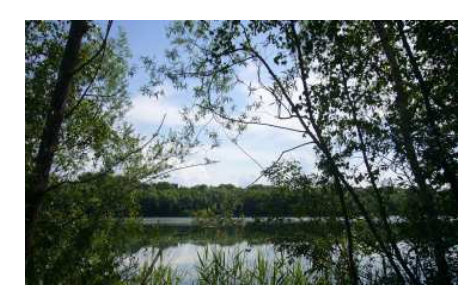
Lake in the recreation centre