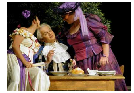
Play in the Stadeltheater

Lauingen (Donau) provides good connections to the transport network, by road, on the B16, as well as by rail, on the train running from Ulm to Regensburg.