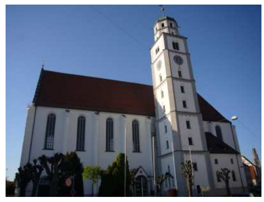
Parish church of St. Martin