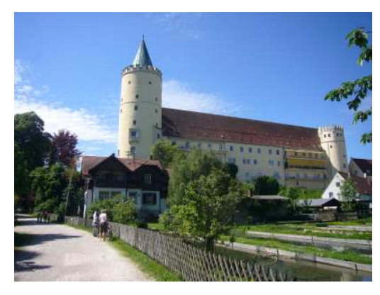
Former Ducal-Bavarian castle

In a part of the town called Faimingen, the most notable Roman temple for "Apollo Grannus " has been partially reconstucted on the original foundations, thus giving an impression of the site`s aspect in Roman times, when it was the biggest roman temple north of the Alps.